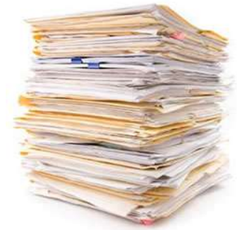
Field Trip Forms

Facilities Recruiting Volunteers Exhibitors Handouts Etc.